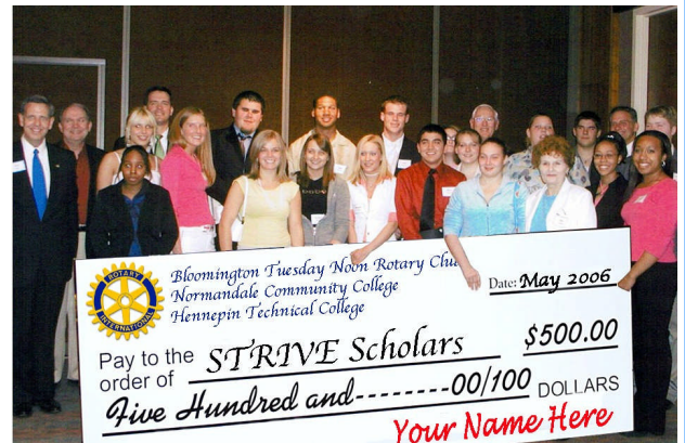
STRIVE student class, 2004-2005. Bloomington Noon Rotary presents several scholarships to students who have achieved their goals during the year.

so that they can get seated with their meals and can talk with Rotarians until about 12:40. Thanks for your help in touching the lives of these students.